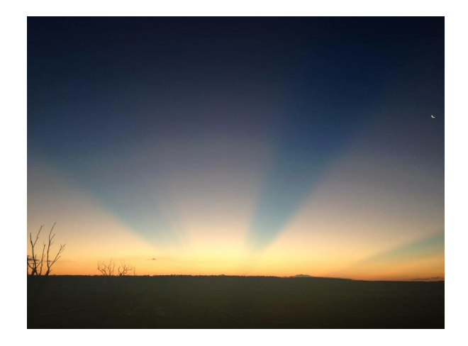
Photo: its all real, folks, taken on an IPhone, no doctoring, no nursing, no first aid!

No matter what bitter wars we face – no matter how badly our land and our people are being raped and pillaged right now, by mostly foreign owned mining companies, corrupt politicians, Mining Mates and Mongrels in Suits – we have managed a very simple miracle. We have stood up and started to fight back. So we need to be proud of that. And then tonight on the sunset, right out of the blue, something completely miraculous happened right in front of our eyes. The rays of the setting sun made a perfect windmill. So let's take it as a sign. You see, the Australian people are coming on side and standing beside us in their millions. A new Golden Age of Farming is just around the corner. We will feed our people, and we will do them proud.